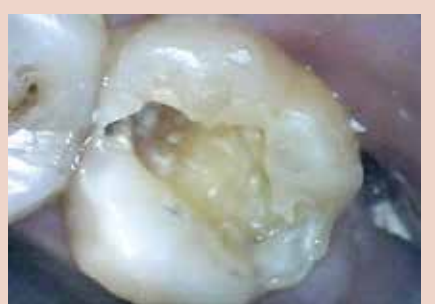
mesial aspect of the second molar and mesial and distal aspects of the first caries along the buccal margin.