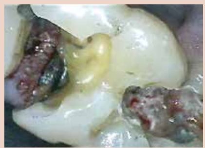
FIGURE 7-Large caries found on the FIGURE 8-Large caries found on the molar.

accurate system to measure and monitor lesion size.