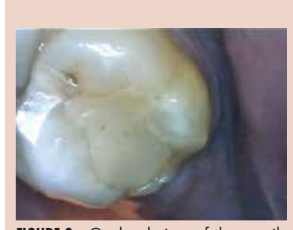
FIGURE 3 —Occlusal view of the maxillary second molar.

The Canary System creates a Canary Number (ranging from 0-100) from an algorithm combining the PTR and LUM readings, which are directly linked to the status of the enamel or root surface crystal structure<sup>22</sup> (Fig. 2). A Canary Number of less than 20 indicates healthy crystal structure. A Canary Number greater than 70 indicates a large lesion that may justify restoration. Canary Numbers falling between 20 and 70 indicate the presence of early carious lesions or cracks that may require restoration, particularly at restorative margins.<sup>23</sup> If the caries is located beneath a healthy layer of enamel, the Canary measures both healthy tissue and caries. The healthy crystal structure overlying the caries dampens the signal, decreasing The Canary Number.